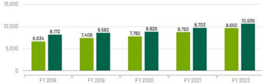
Operational Spending ($)