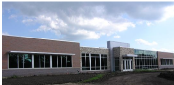
And, FutureCeuticals (above) is nearly finished converting a vacant Rte. 17 auto dealership

Three notable manufacturing projects are underway in Momence—an important employer hub on Kankakee County's east end. Silva has completed a $2 million expansion. Filter manufacturer Precisionaire is consolidating operations at its Momence site, returning lines once outsourced to Mexico.