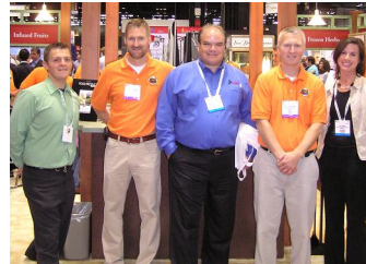
Alliance staff members join Van Drunen Farms, the country's largest supplier of organically grown culinary herbs, at the Chicago IFT/Process Expo in July.

natural point of focus for the Alliance in 2010.