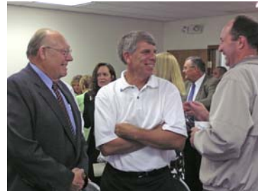
UDS/Alliance press conference