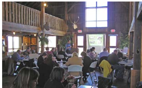
This fall, the Alliance and KCC's new Sustainability Center hosted a Sustainability/Green Technology Tour. Participants toured sites that utilize renewable fuel sources—Kankakee's hydroelectric power site, its newly renovated and LEED-certified city hall, and the Kankakee River Metropolitan Agency's waste-water treatment plant. They also learned about local wind power initiatives.