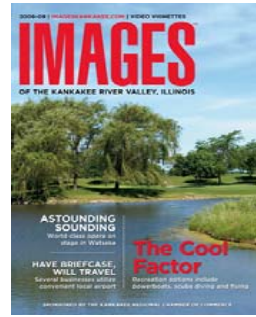
The Economic Alliance was featured in the 2008 edition of IMAGES magazine, published by the Kankakee Regional Chamber of Commerce.