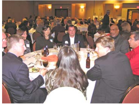
More than 150 attended the Alliance's inaugural Annual Dinner & Meeting